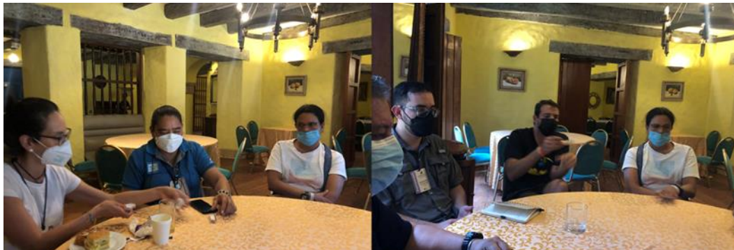
IAC Secretary meeting with representatives from Sea Turtle Conservancy, Panatortugas, IAC Delegate and National Aeronaval Service from Panama

The meeting was an opportunity to recognize the valuable work that organizations of civil society carry out in data collection and their important contribution in the country's annual reports that IAC member countries submit to IAC , as well as reiterate the importance of maintaining collaborative work between the government, NGOs and law enforcement authorities to guarantee the security and success of the results in conservation projects at the national level.