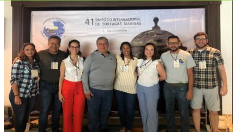
Top picture: IAC Delegates from United States, Ecuador, Panama, Belize and the IAC Secretary gathering for a photo during the International Symposium on Sea Turtles in Cartagena, Colombia.

The IAC Secretariat had the opportunity to attend this event and participated in some regional meetings within the framework of the symposium.