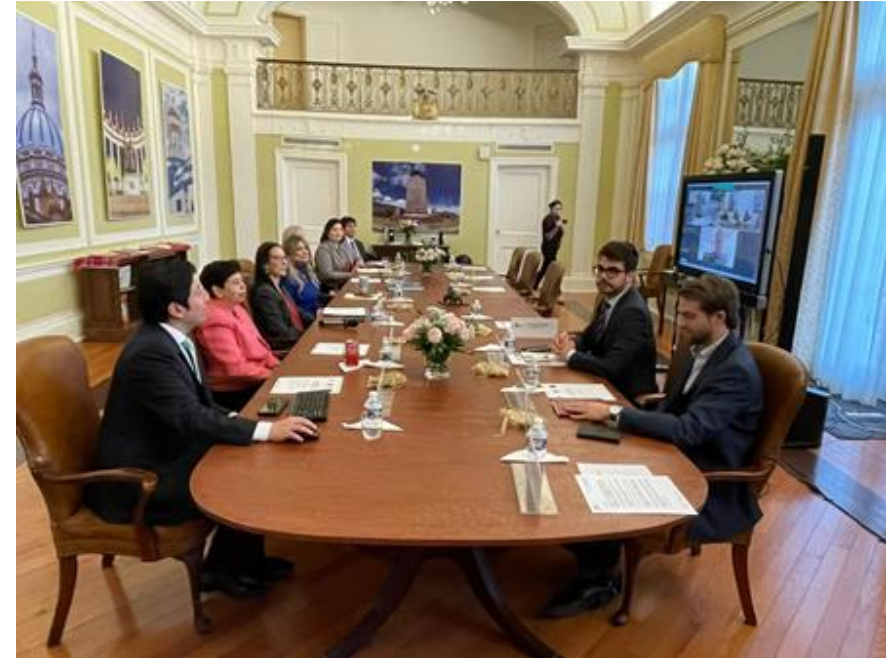
View of the meeting from the Embassy of Ecuador in Washington, DC.