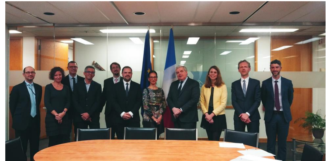
Picture 2: Ceremony at French Consultate in Vancouver, Canada. Participants from Ministry of Ecological Transition and Cohesion of the Territories del Mar, the French Biodiversity Agency, and staff from the Consulate.