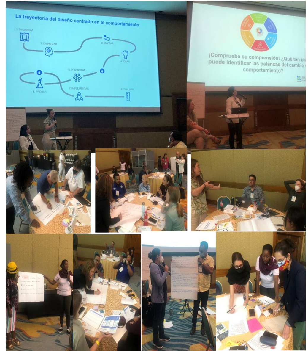
Pictures of different activities during the special session delivered by RARE.