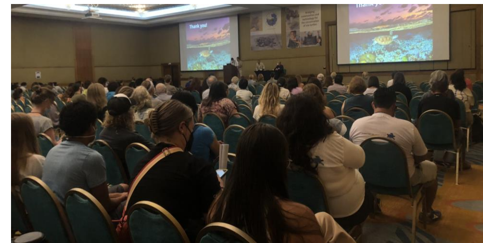
Bottom picture: One of the many presentations offered to all attendees at the ISTS41