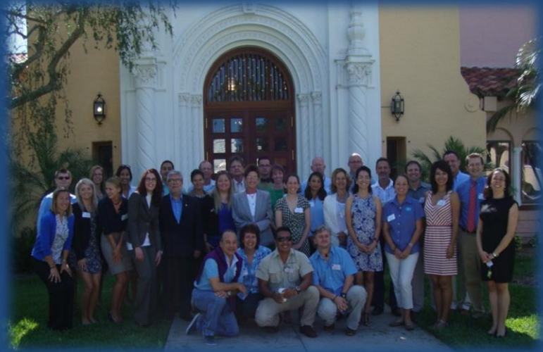
Group Picture CCE7