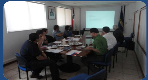
Meeting of the Regional Board , May, 2014

One of the important milestone to be highlighted is that the Regional Government of Arica and Parinacota, funded in 2011 the Marine Turtle Conservation Program, executed by the Arturo Prat University (Tortumar-Chile). This Study serves as a base to obtain technical and scientific information on which the Regional Board of Sea Turtle is currently working in order to evaluate the possibility of establishing a Protected Area. Therefore, it would provide a figure of legal protection, for both the species and foraging habitat.