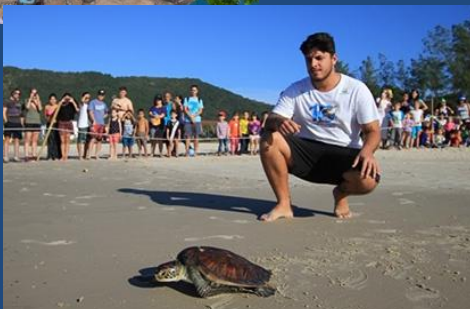
Celebration Activities World Sea Turtles Day 2014