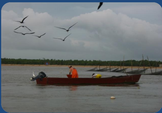
Fishermen on Suriname River mouth, fishing nets and leatherbacks and green turtle nesting beach

Some of the meeting's results were the creation of the CMA working plan, which includes on the sea turtle components, working mainly with IAC and WIDECAST in the topic of the impacts of climate change on sea turtle habitats and promoting capacity building and information exchange. Moreover, IAC Secretary held meeting with Suriname environment authorities to discuss the country's possibility to start the adhesion to the IAC Convention.