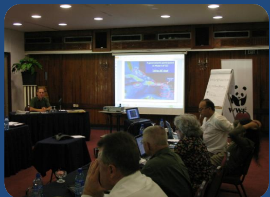
CMA Annual Meeting