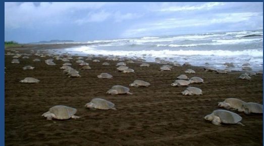
Olive-Ridley Arribada

For details of activities, follow the link: http://www.fisheries.noaa.gov/stories/a/species/turtles/index.html