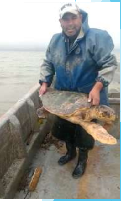
Release of a sea turtle from an argentinian fleet.