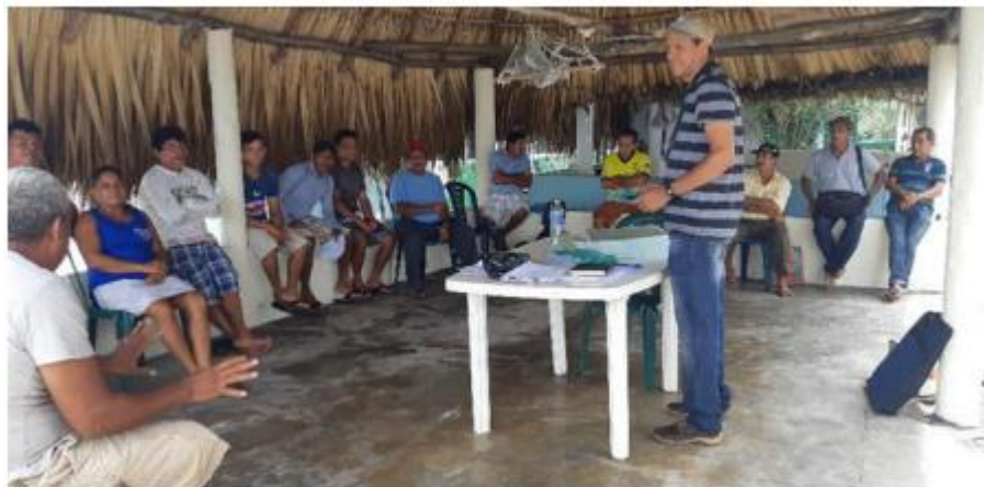
Figure 3. Inauguration of the 2019-2020 sea turtle season by staff of the South East Regional Office, with hatchery and community managers, in Aldea Las Lisas, Chiquimulilla, Santa Rosa.