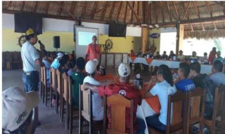
Figure 6. Inauguration of the 2019-2020 sea turtle season, with parlameros , in Aldea Monterrico, Taxisco, Santa Rosa, a talk is provided by the staff of the South East Regional Office, indicating the correct handling of the eggs collected and their transfer to the hatchery.