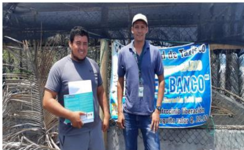
Figure 10. Visit to the Banco hatchery, Taxisco, Santa Rosa; where the field inspection was carried out for the registration of the hatchery.