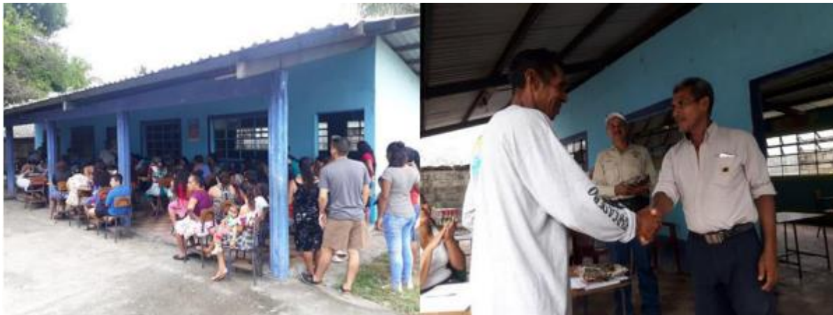
Figure 7-8. Talk by the staff of the South East Regional Office, during the Inauguration of the 2019-2020 sea turtle season, in Aldea La Barrona, Moyuta, Jutiapa.