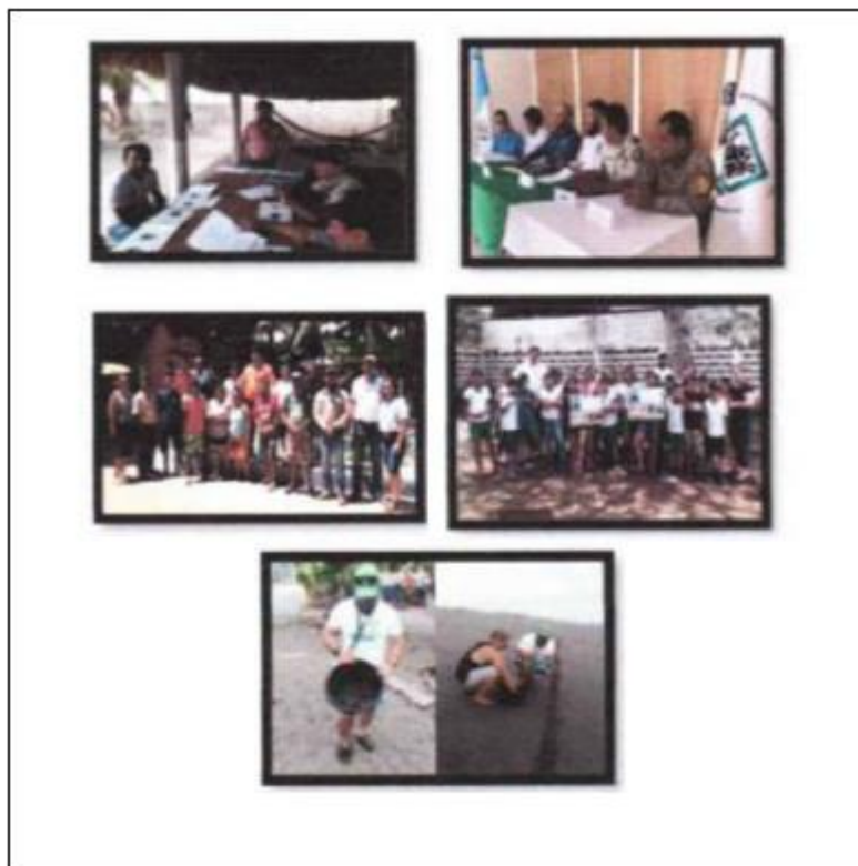
Figure 4. Different activities carried out by the South Coast Regional Office (season opening press conference, environmental education and hatchlings release).