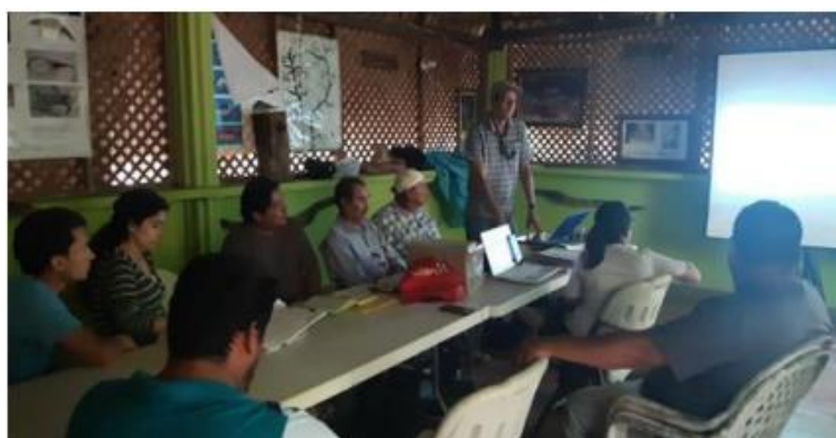
Figure 5. Inauguration of the 2019-2020 sea turtle season by the staff of the South East Regional Office, with hatchery and community managers, in Aldea Monterrico, Taxisco, Santa Rosa.