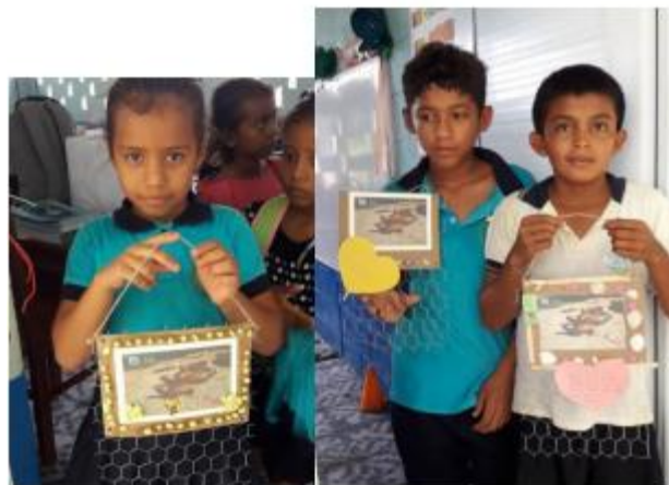
Figure 12. CONAP made an approach with children from different schools in the Caribbean Region, with the purpose of making crafts on mother's day, using the sea turtle to create citizen awareness.