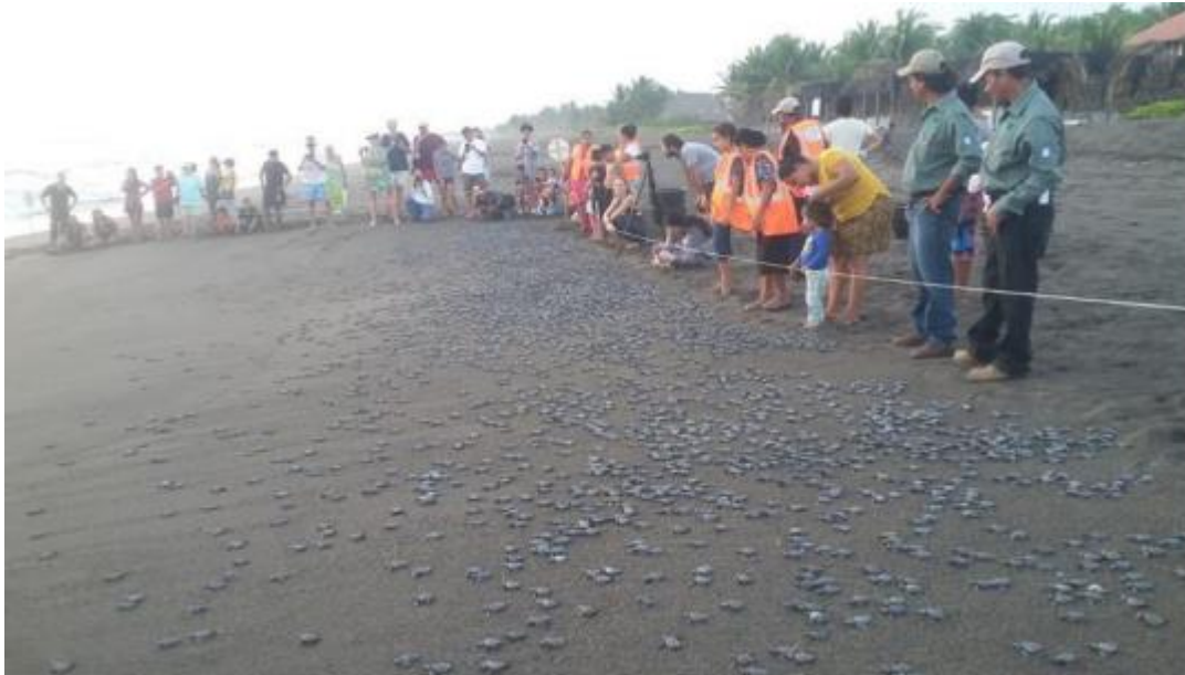
Figure 9. The South East Regional Office, together with the Banco Hatchery, carried out the symbolic release of hatchling sea turtles with community members and the national media.