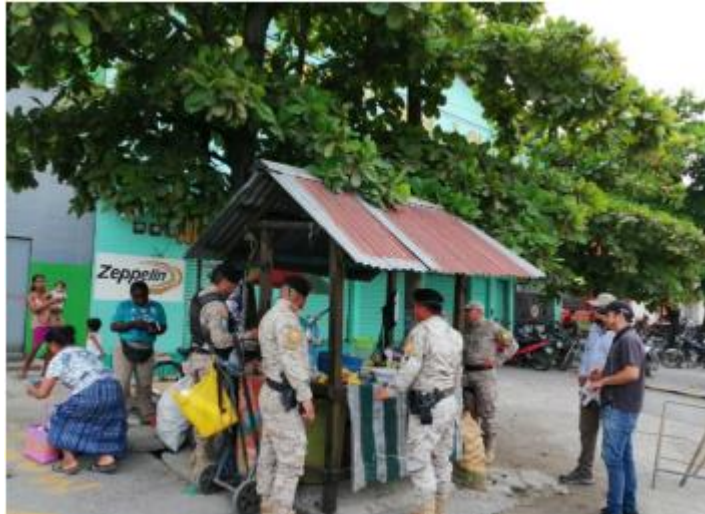
Figure 11. Work with the environmental police authorities and CONAP, inspecting possible points of consumption of eggs, in the Guatemalan Caribbean area.