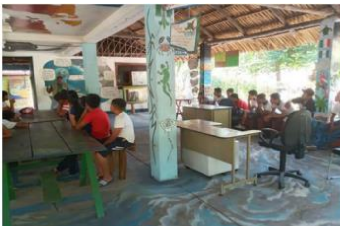
Figure 1. Talk by the staff of the South East Regional Office, at the ARCAS facilities, Parque Hawaii, Aldea Hawaii, Chiquimulilla, Santa Rosa, with young people from Aldea el Obraje, Chiquimulilla, Santa Rosa.

The corresponding Regional Offices (South Coast, South East, North East) carried out educational activities for schools in the area (children and teenagers), tourists and the general public. At the beginning of each season, talks were provided to hatchery managers and people who collect eggs, emphasizing on the correct techniques for handling them. In the case of strandings, a form was standardized and distributed so that local people could collect recent data on the event prior to the arrival of the personnel in charge.