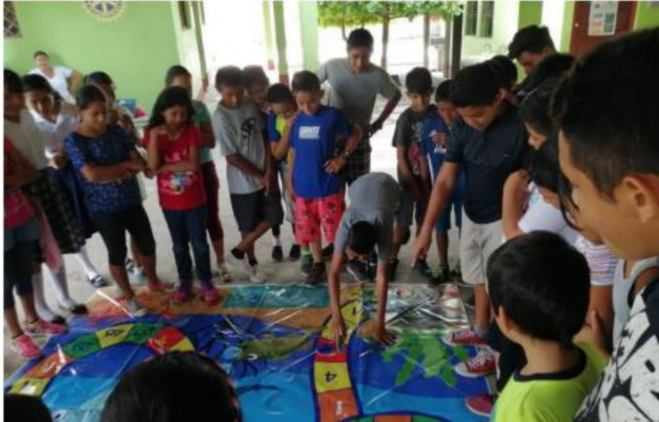
Figure 2. Awareness activities through games, carried out by the staff of the South East Regional Office, in the facilities of the Mixed Rural Official School of Aldea La Curvina, Chiquimulilla, Santa Rosa.