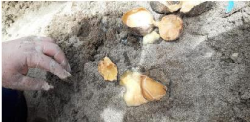
Figures 13 and 14. Visit to the Vivero Guatemala hatchery located in the Caribbean, verification of leatherback ( Dermochelys coriacea ) nests where hatching was not successful.